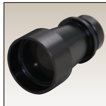
Long eye relief 3 X (option)